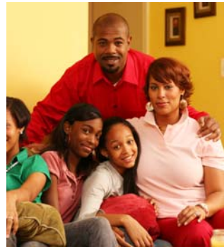
CLC GAL's help build stronger families

The CLC partners with Safe on Seven, an innovative program housed on the 7th floor of the Forsyth County Hall of Justice, to provide assistance to victims who have filed for a Domestic Violence Protective Order. If there is a question regarding the safety or custody of children, District Court judges appoint CLC GALs to investigate and report.