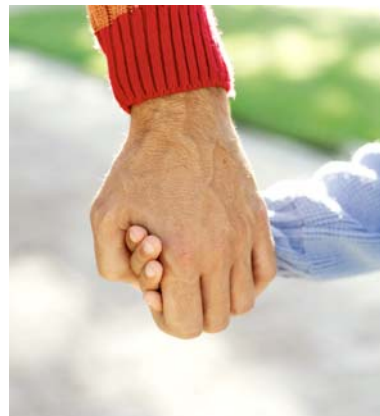
Domestic Violence is a Community Problem. The CLC is part of a Community Solution.