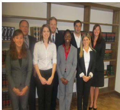
CAC Students, Fall 2011